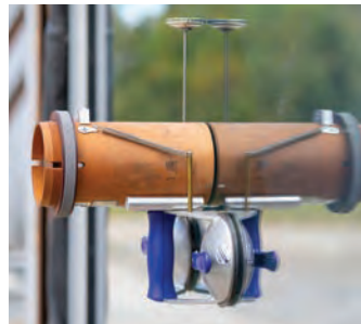
Field evaluation of Insulating Glass Units.