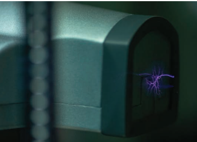
Spark Emission Spectroscopy provides a means by which to measure the Argon Gas Concentration between lites of an Insulating Glass Unit.

With testing capabilities that extend beyond the laboratory, Molimo can provide in-situ testing of insulating glass units. The use of portable instruments for Frost Point analysis as well as Gas Concentration allows us to evaluate insulating glass anywhere.