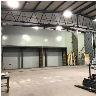
Indoor Test Wall