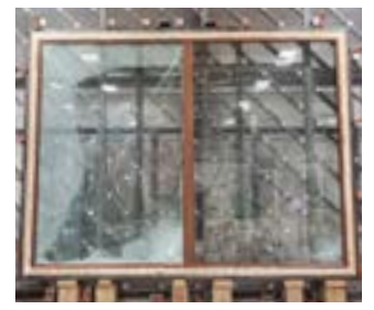
Structural Test Wall