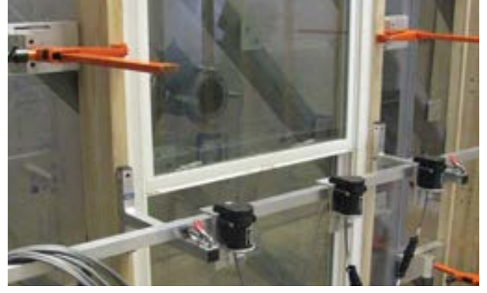
Window System Deflection