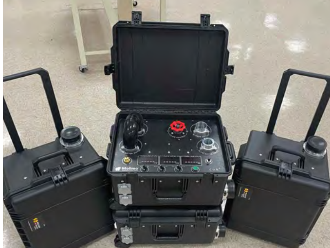
Custom Test Packs