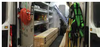
Fully Equipped Mobile Unit