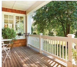
Verify Code Compliance