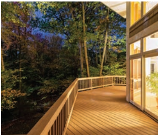
Ensure Product Integrity