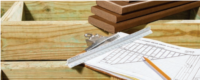
Vet Installation Practices