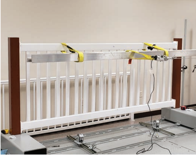
Test in Our Accredited Lab