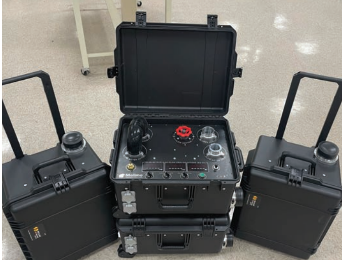
Custom Test Packs