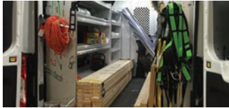
Fully Equipped Mobile Unit