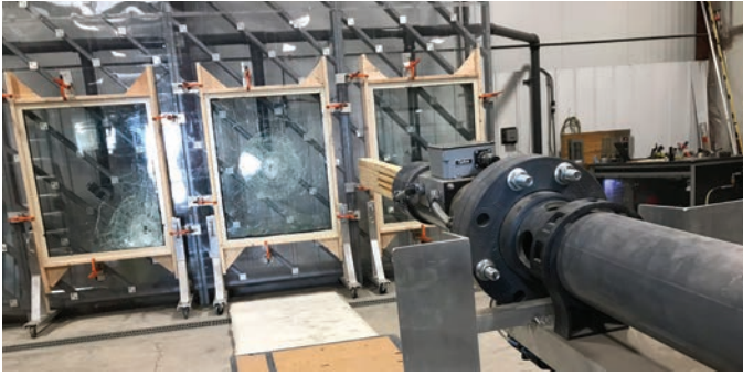
Test in Our Fully Accredited Lab