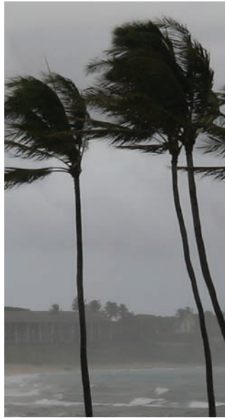
Certify for Any Region