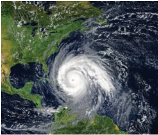
Prepare for Any Storm