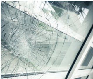
Perform in the Field