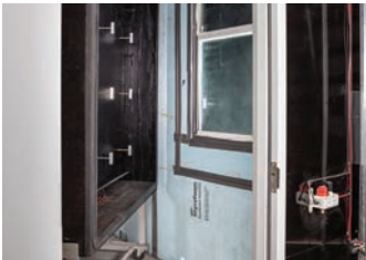
Appropriately Sized Metering Area