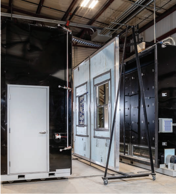
New State-of-the-Art Thermal Test Chamber