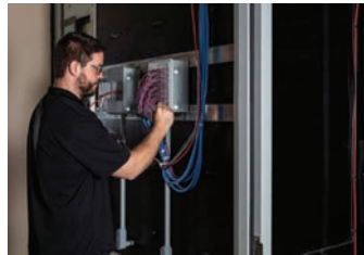
Rapid Sample Changeover